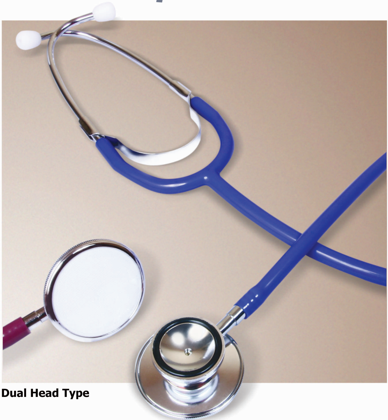
Dual Head Type